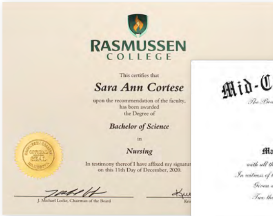
Examples of Diploma customization.