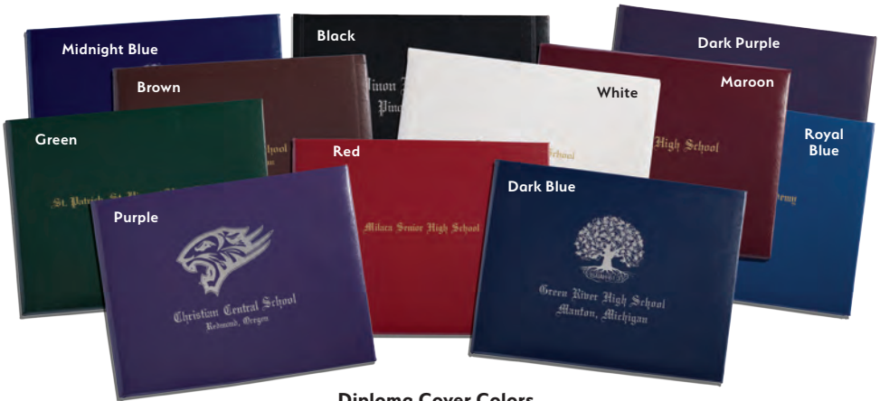
Diploma Cover Colors

Contact your Account Coordinator to get started on designing your school's Custom Diploma Cover .