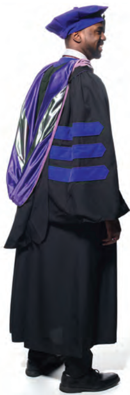
SCG(size code)BKD - DOCTORAL SET