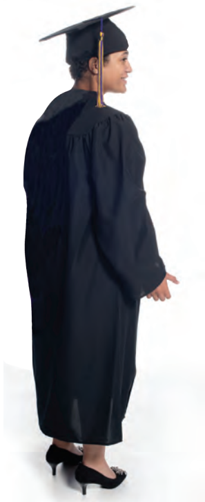
SCG (size code) BK - BACHELOR SET