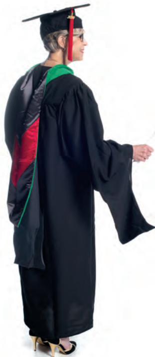
SCG (size code) BKM - MASTERS SET